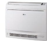
Low Wall Console ● 9,000–12,000 Btu/h ● 9,000–15,000 Btu/h